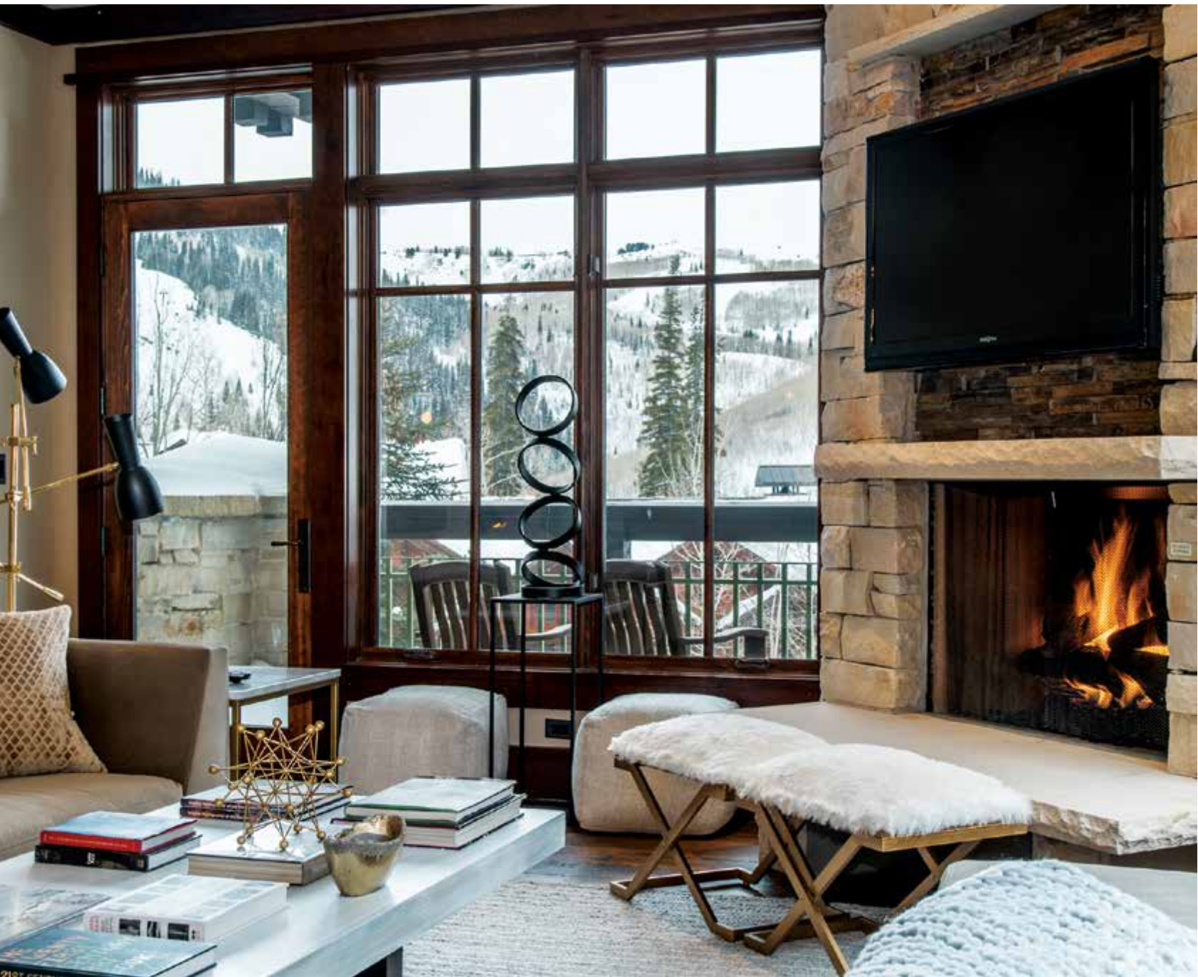
DESIGN AND DECOR, DRESSED DESIGN

A refreshed ski-in/ski-out Empire Pass condo seduces with snappy looks and lofty views