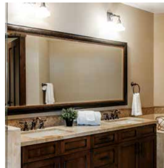
FROM LEFT: The condo's layout means both bedrooms have total privacy; after a complete interior upgrade, every room is move-in ready.