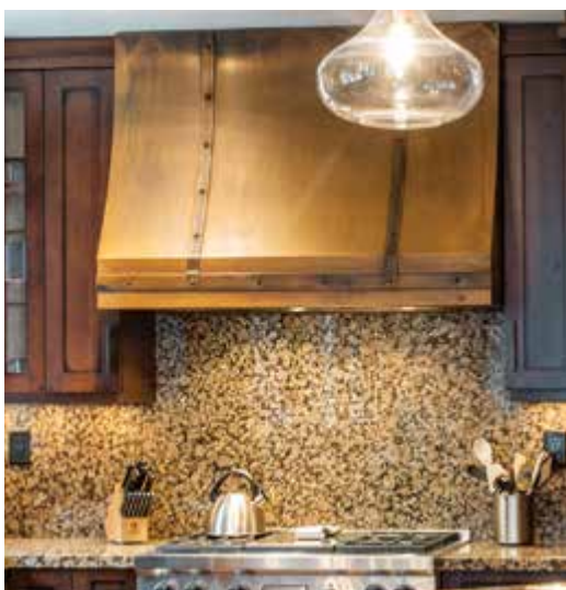
FROM OPPOSITE: With its corner location, there's a wealth of light, views, and privacy; the kitchen's lustrous copper range hood; repurposed barn wood floors stand up to family living.